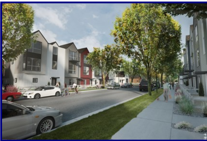
Rendering of the future Depew Street in West Line Village

For more information on this project, visit http://westlinevillage.com/ .